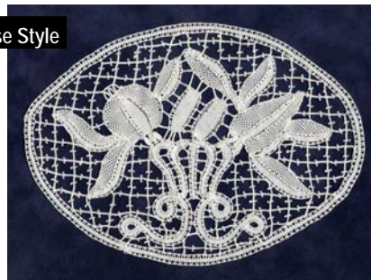
Bobbin Lace Milanese Style