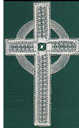
Bobbin Lace Milanese Style

This workshop will cover two styles of lace making: Tape Lace , which was adapted throughout many countries in Europe because it is quick and easy to make; and the Milanese Style Lace , a more complicated process.