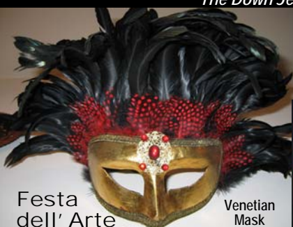
Festa dell' Arte Venetian Mask

"Artigianato Popolare: Italian Folk Arts and Crafts" May 12 through December 31, 2006